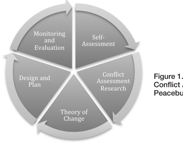
Figure 1.1 Components of Conflict Assessment and Peacebuilding Planning

levels, such as remote tribal groups, urban communities, and high-level policymakers. The handbook's intended audiences include all those individuals and groups from inside and outside of a conflict that are considering how to change the dynamics of conflict to foster peace: