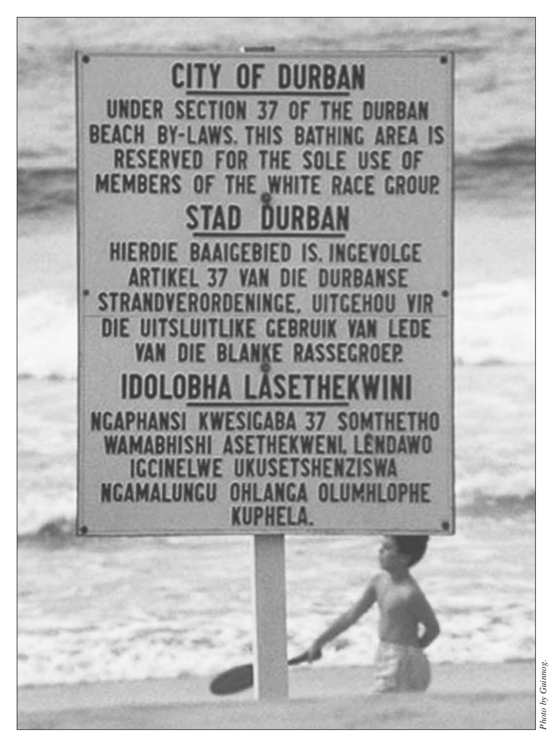
Sign in Durban that states the beach is for whites only under apartheid laws. The languages are English, Afrikaans, and Zulu.